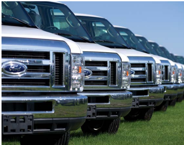
Ford F-150 trucks now use high-strength aluminum rather than steel for their body, reducing weight and increasing efficiency and pulling power.

A very unique materials problem that BES took on concerned plutonium, a key ingredient in nuclear weapons. Plutonium has a split personality—it comes in brittle and ductile forms, and if you try to machine a bomb part with brittle plutonium, it shatters. BES-supported research found that the cause of this duality stems not from plutonium’s microstructure, but from its chemical bonding. It turns out that plutonium’s electrons can form two kinds of bonds, one leading to the ductile form and one to the brittle form. Once this subtle phenomenon was understood,